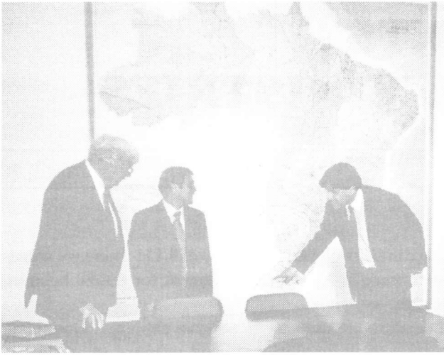
TWR Brazilian Outreach

Among the Spanish speaking peoples, the converts are being faithfully followed-up by co-operating churches; also by such TWR Spanish radio ministries as that of the late Dr. J. Vernon McGee in his regular "Through the Bible" broadcasts.