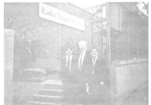
TWR Headquarters Brazil