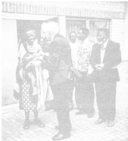
The Prince of Swaziland joyfully receives Your Quest for God

Yes, on your behalf, I received overwhelming expressions of gratitude from every social strata of the Swaziland culture: From of a son of the King of Swaziland; from African evangelists; from church elders; but most of all from the very poor people for whom, my messages were being translated. They were all very happy to receive a Gospel book, not only for their own instruction, but also as a vital aid to their personal evangelism. Now we ask you to join us in praying that the seed of the Word of God presently being sown among humble and spiritually hungry people will reap an abundant harvest. At the time of writing we have already received preliminary news of much blessing.